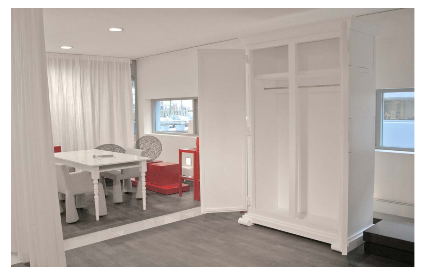
Moooi showroom. Breda, The Netherlands.