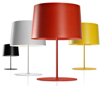
Table lamp made of composite lacquered material on a fibre glass base, available in four colour finishes. The diffuser guarantees maximum exploitation of the light source which offers direct lighting on the surface below and effective reflection of the light upwards.