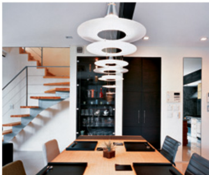
Private Residence Japan. Tokyo, Japan. Architect: Art Web House, Inc. Tokyo, Japan.