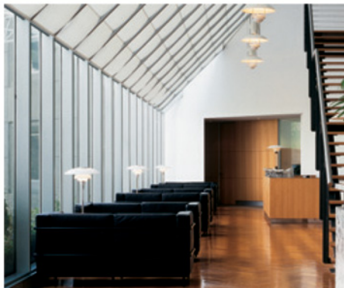
Spowers Architects. Perth, Australia. Architect: Spowers Architects