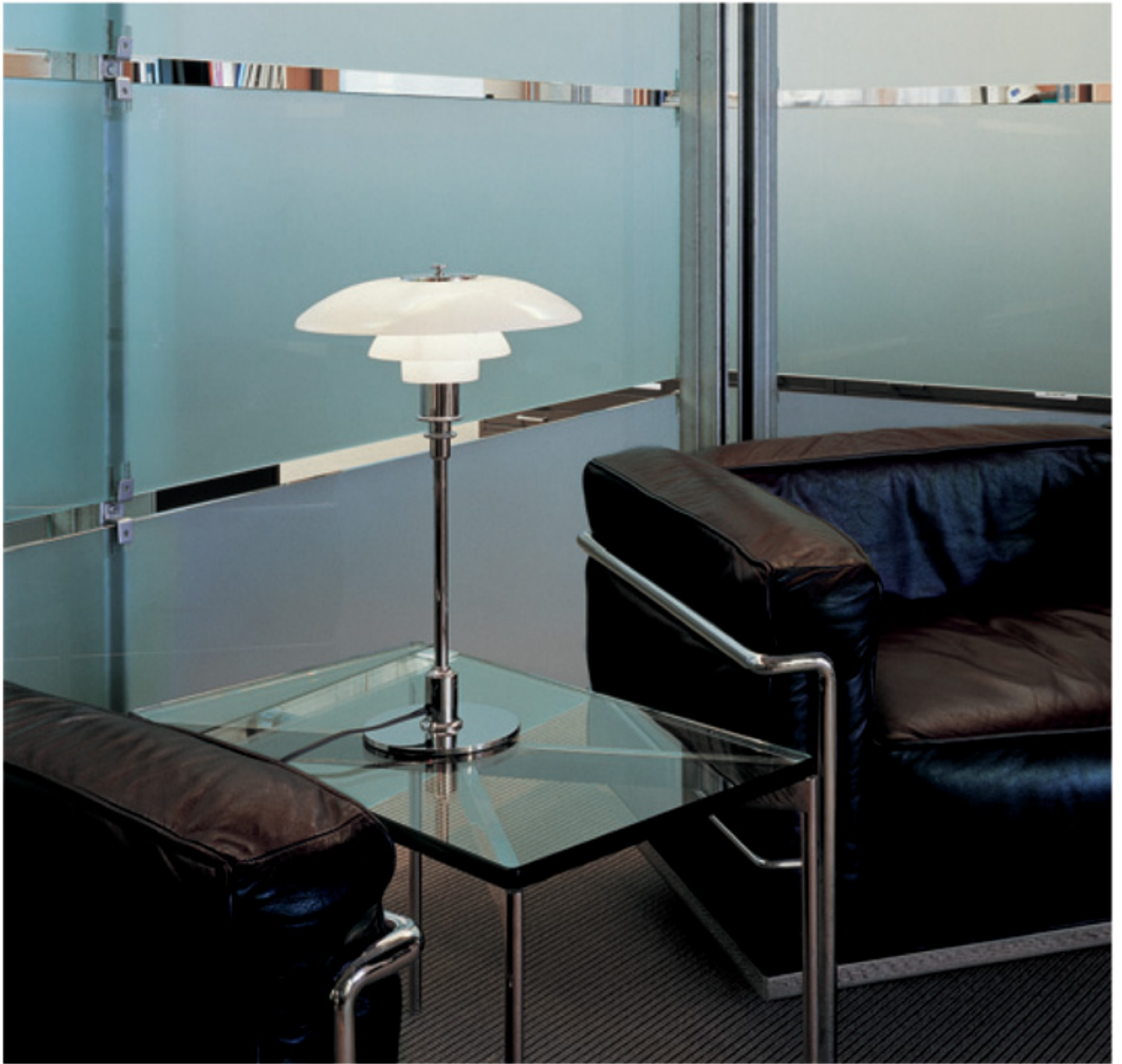
AC Martin Partners Los Angeles, California, USA Architect AC Martin Partners