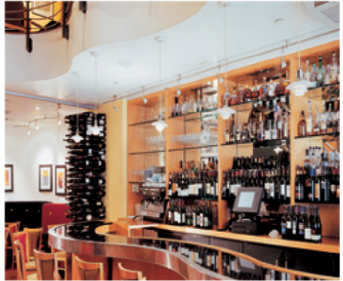
Morrell Wine Bar, New York, New York, USA. Architect: Space Design.