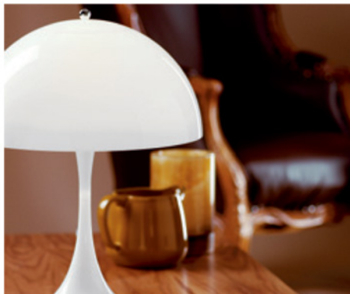
Private residence.