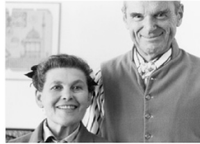
Designers: Charles and Ray Eames