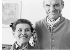
Designers: Charles and Ray Eames