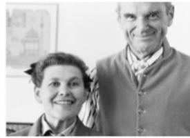
Designers: Charles and Ray Eames