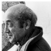
Designer: Isamu Noguchi