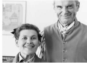
Designers: Charles and Ray Eames