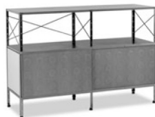
2 units high/2 units wide