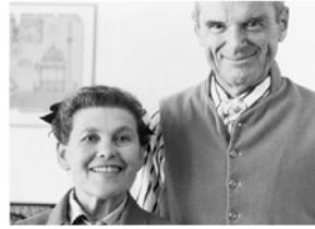
Designers: Charles and Ray Eames