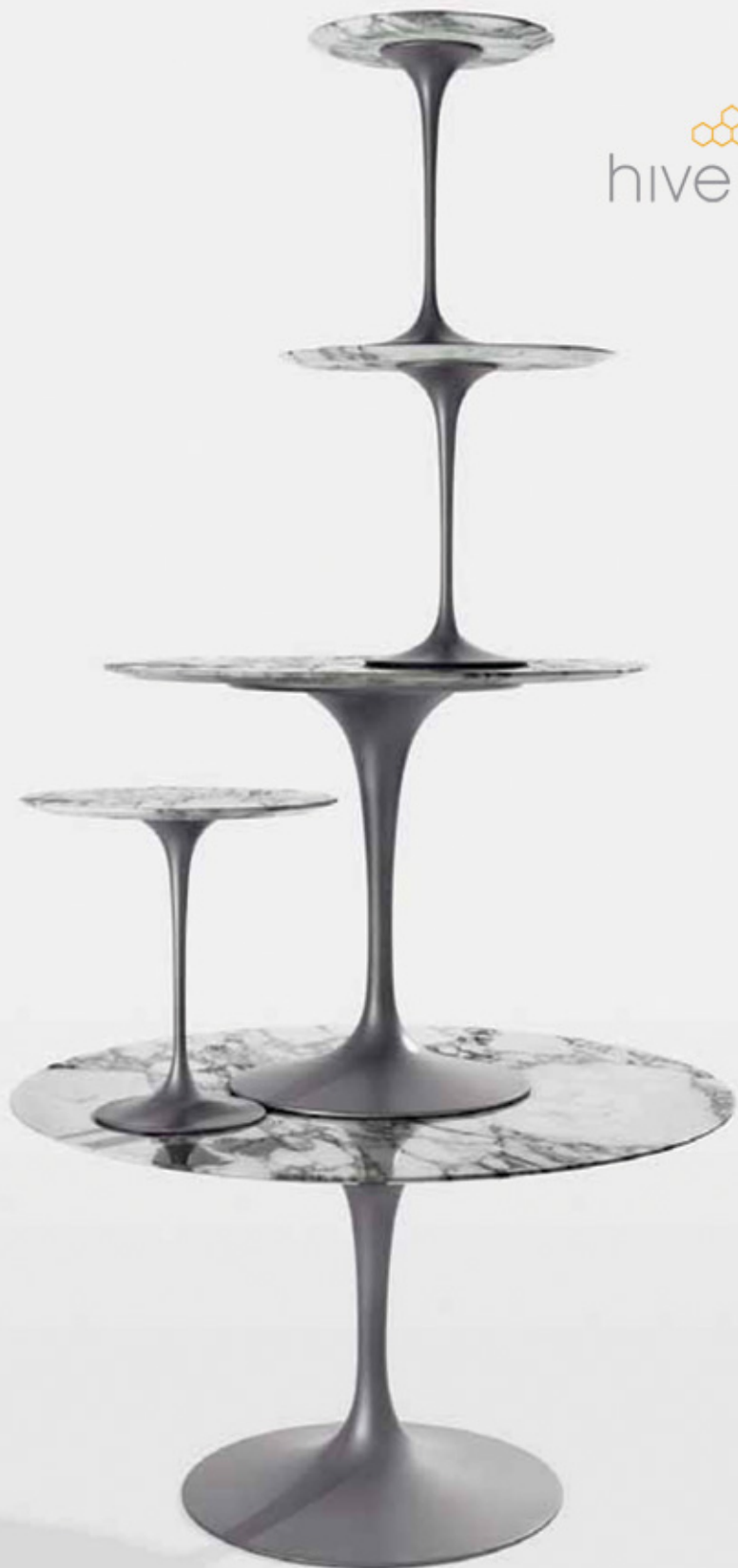
Saareinen Dining and Side Tables with Platinum base finish and Arabescato marble tops.